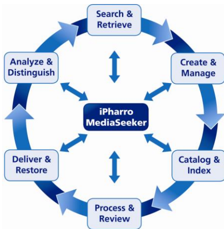
Figure 2: iPharro MediaSeeker's broad, value-based applicability and integration points

The iPharro MediaSeeker core platform is a scalable, robust and most importantly, flexible fingerprinting engine. The core architecture, based on iPharro's Adaptive Video Fingerprinting™ technology, was designed to apply variable fingerprinting density across multiple use cases and provide fully parameterized controls for the content owner.